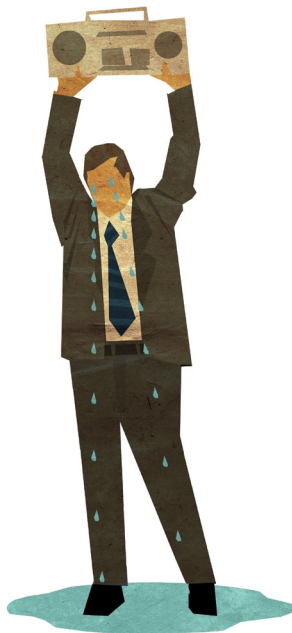
Illustration by Ryan Graber

or benevolent gestures expressing sympathy or a general sense of benevolence relating to the pain, suffering, or death of a person involved in an accident, and made to that person or to the family of that person, shall be inadmissible as evidence in a civil action." But the statute also says that "[a] statement of fault, however, which is part of, or in addition to, any of the above shall not be made inadmissible." This is problematic, since studies suggest that partial apologies (those that do not include any statement of fault) do not deter litigation in the same way. In fact, under