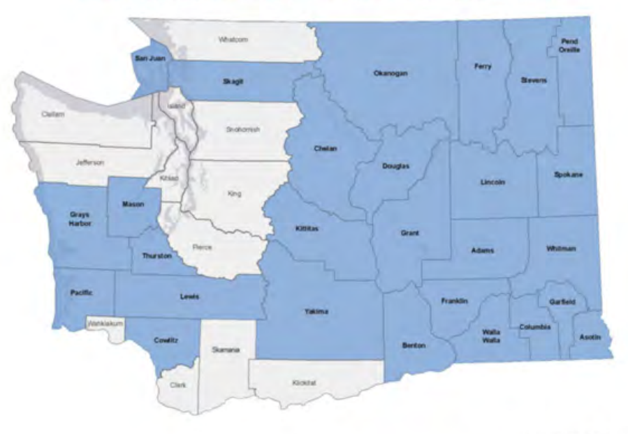
VSP "opt-in" counties shown as shaded