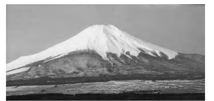
Mt. Fuji from our hotel room on Lake Yamanaka

these squatting toilets from Turkey and the former Yugoslavia) and what they call Western. But these ain't like any Western toilets I know. These high-tech toilets feature an array of electronic bells and whistles, so to speak. It was always a thrill to see what would happen when I tapped on a particular button written in Japanese. (Did I mention