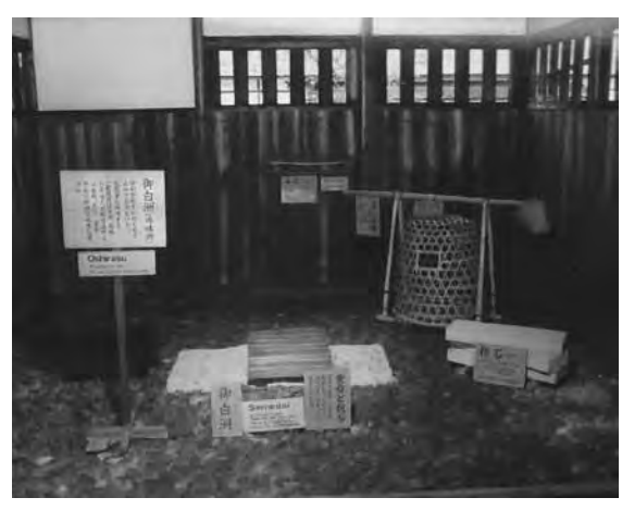
Jinya (Government House) still in use in Hida Takayama. Photo shows instruments of torture of yore used on defendants.

I learned in Japan. There are many reasons why I want to return to Japan. Reverence for age is one, sure. Another is the thrill of seeing over the masses thronging its storied railroad stations. Being 5′6″ has its perks.